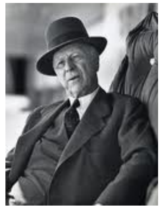
"The Great Wildcatter"